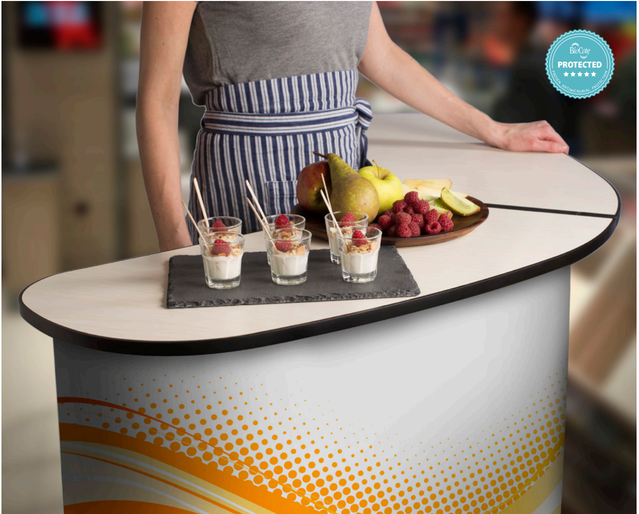
Counter with antimicrobial top & transport box on wheels