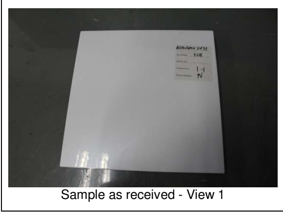
Sample as received - View 1