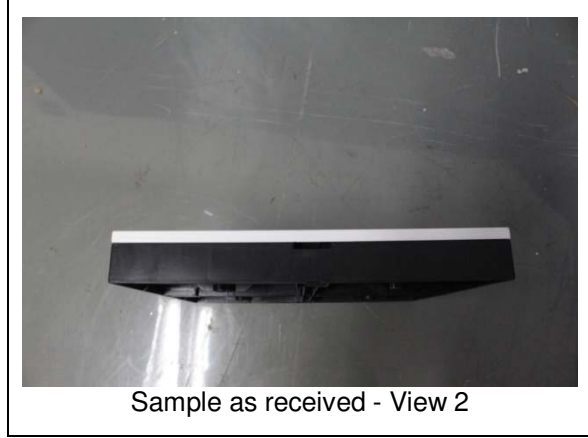
Sample as received - View 2